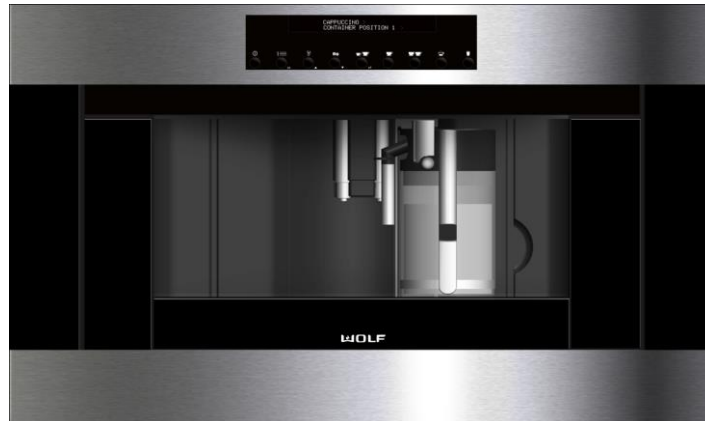
Wolf's One Touch Coffee System from £3,062 inc VAT

Set within SieMatic's classic Beaux Art and contemporary S2 furniture, this breathtaking display contains Wolf's brand new One Touch Coffee System featuring customisable brew strengths and cup sizes along with refrigerator-safe milk frother with adjustable settings for cappuccino, latte and macchiato, plus auto-timers to create the perfect wake up coffee in the morning.