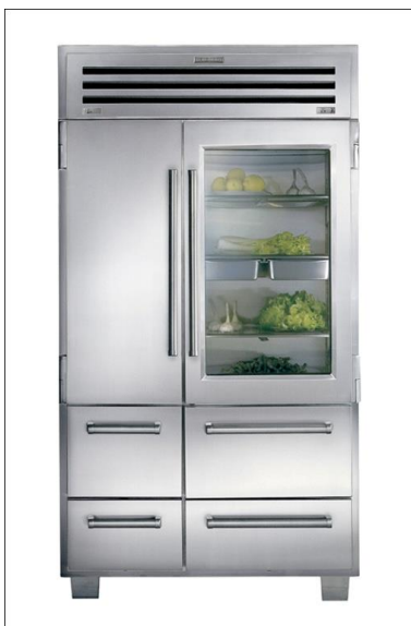
Sub-Zero's PRO48 Fridge/Freezer £24,475 inc VAT