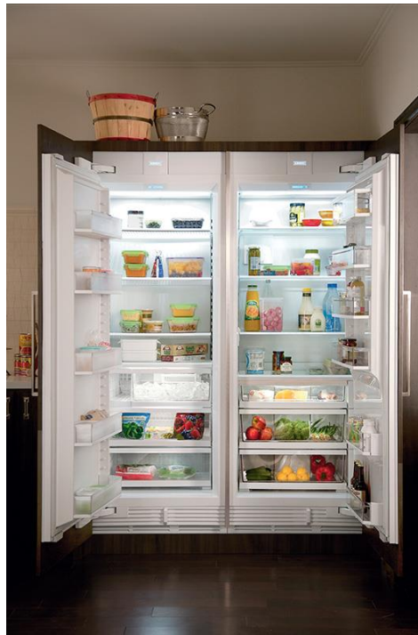
Sub-Zero's ICBIC-30R column refrigerator and ICBIC-30FI Freezer £8,070 inc VAT Each

synch with high tech systems such as Crestron and Control4. The internal water dispenser – an industry first – offers convenient filtered, chilled water without the need for an external dispenser, maintaining the sleek elegant exterior lines of the unit.