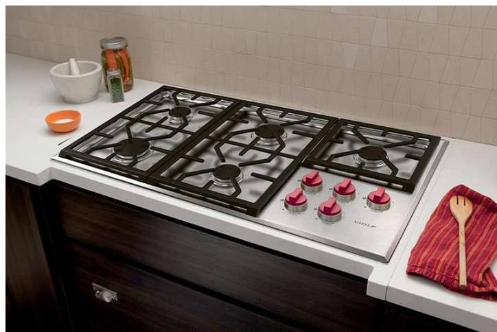
Sub-Zero refrigerated drawers from £5,350 inc VAT Wolf Professional Gas Cooktops from £2,237 inc VAT