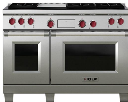
Wolf's ICDF484CG Dual Fuel Range £16,100 inc VAT